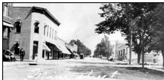
100 south block of Pub- lic St. look- ing north, ca. 1910.